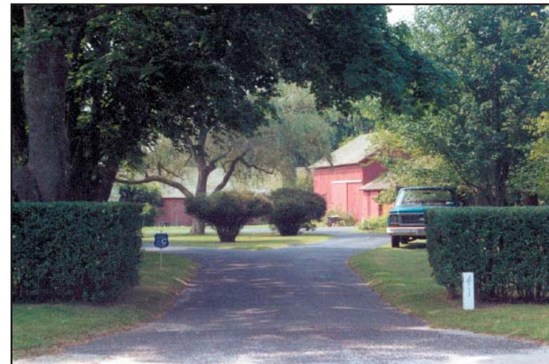
Stanley Mill Farmstead, Westhampton

The entire stretch of Old Country Road between Montauk Highway and the Brookhaven Town line, adjacent to the Pine Barrens area, is a scenic route of woodland buffers, commercial nursery stock, small family farms, residential homes and various mixed-uses. The largest intact piece of farmland in the Old Country Road area, left from the original Raynor agricultural tract that ran from Apaucuck Neck on the bay to the railroad tracks is the ten-acre Stanley Mill Farmstead. Adjoining small farms owned by various families and the larger land tract utilized by Peat and Son Nursery together evoke a historic, rural feel for the area with their homesteads, barns, and other agricultural outbuildings presenting as Hamlet Heritage Resources.