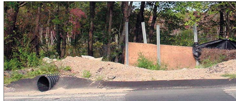
The drainage system throughout the Study Area needs to be evaluated to mitigate flooding hazards along local roadways.

Running through the Study Area are a series of rivers/streams, trending in a generally north-south direction. It was observed in the field that several major hamlet roadways (e.g., Old Country Road and South Country Road) are subject to potentially severe flooding in certain location, to the extent that portions of the roadway are closed during major storm events. This creates potentially serious access issues for residents and emergency service providers.