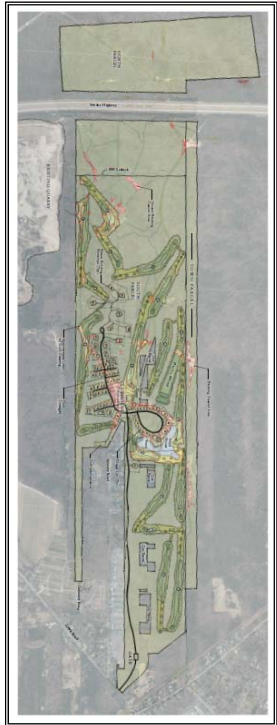
Figure 1: Project Conceptual Plan

On December 09, 2008 the Town Board implemented the recommended upzoning by changing the CR-80/CR-120 zoning category of the subject property to CR-200 zoning. On March 24, 2011 the Planning Board adopted an updated pre-