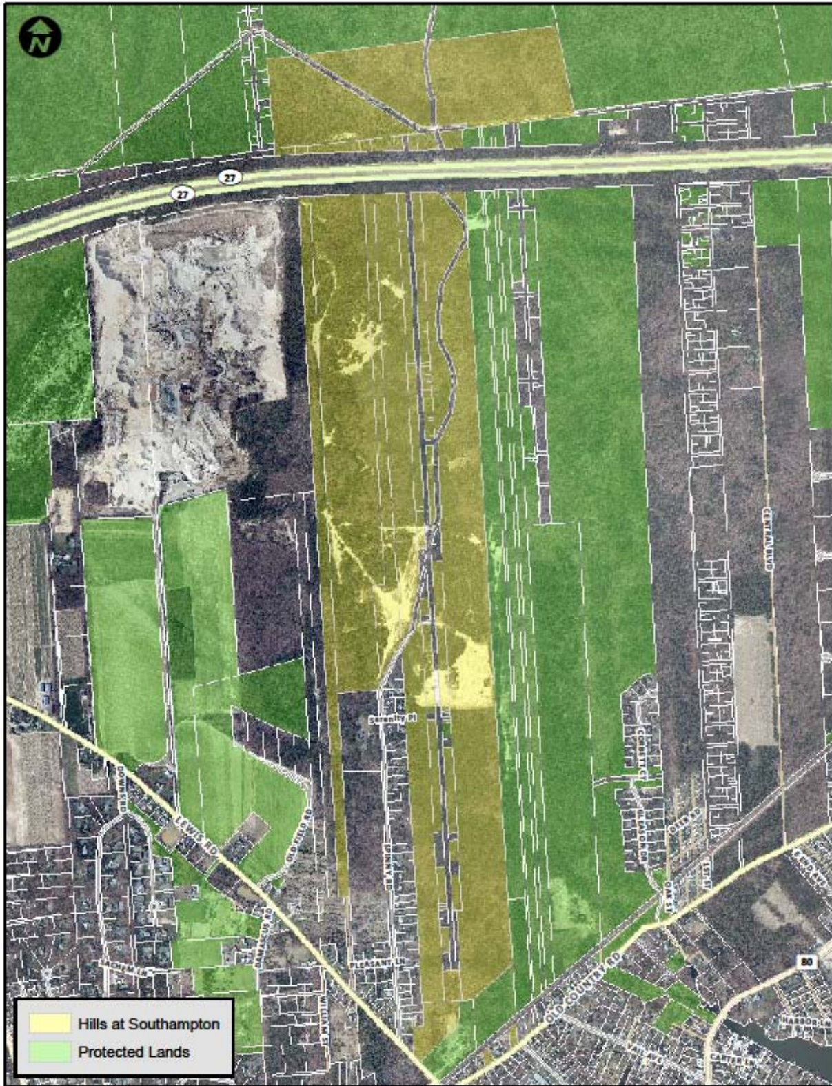
Figure 3: Existing Conditions: Clearing associated with the subject site.